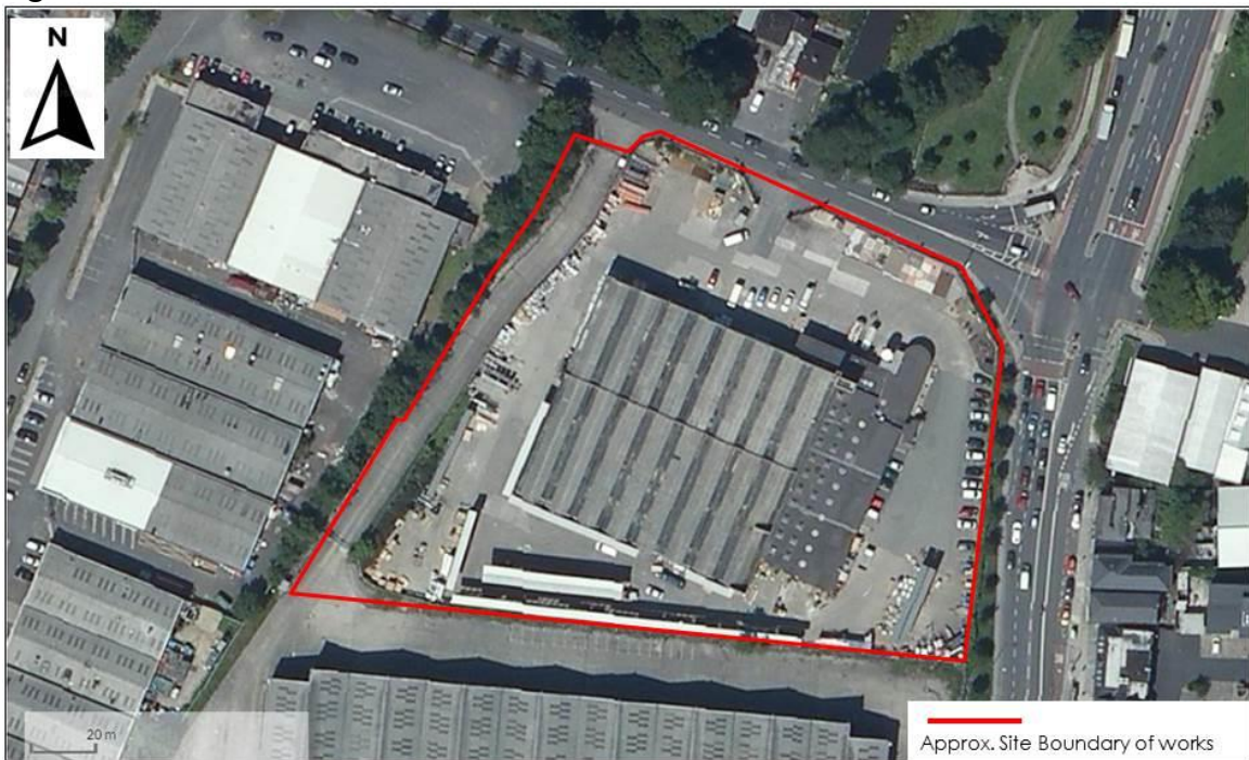
Figure 3 Aerial Photo of Site