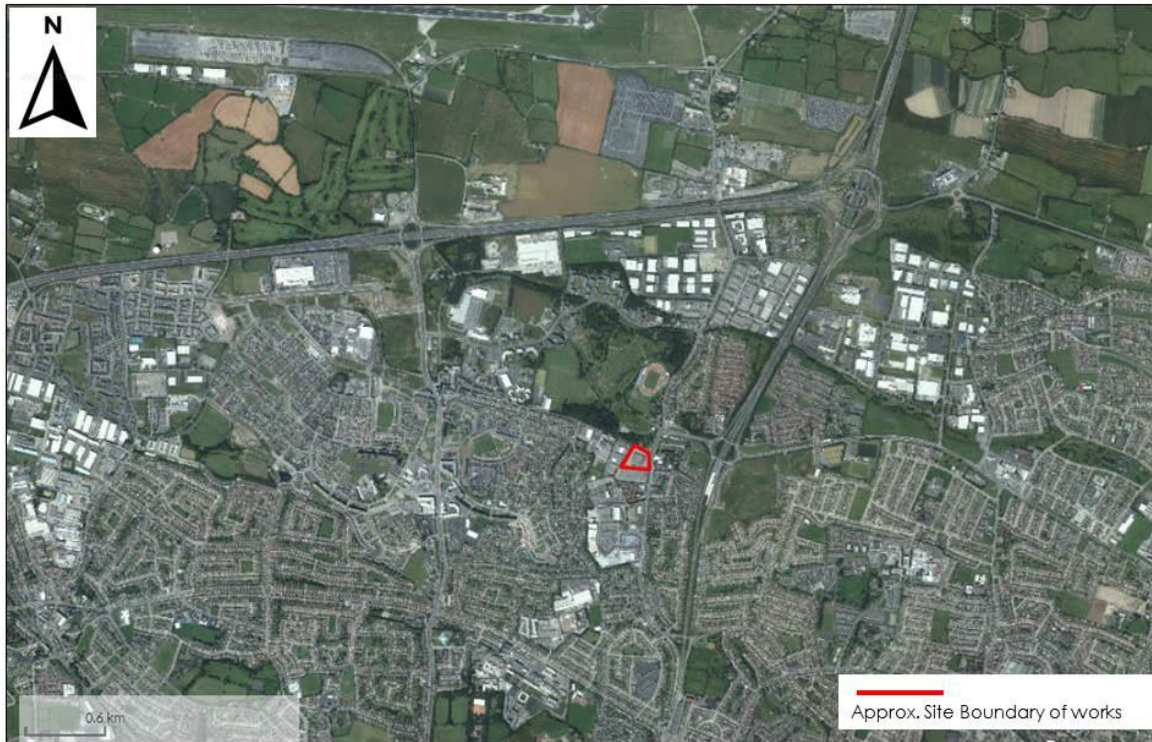
Figure 2 Aerial Photo of Site and Surrounds